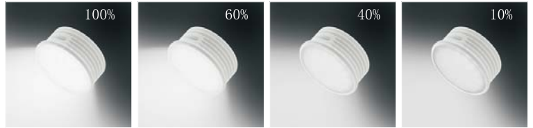
4-Stufen Dimmer/ 4-steps dimmer

(on) — (off) — (on) — (off) — (on) — (off) — (on)